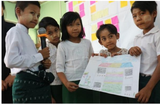
Nabekone BEPS students draw their dream school in MOFA project kick-off for Enhancing Comprehensive School Safety in Collaboration with Community in Hinthada Township.

ဟင်္သာတမြို့နယ်တွင် ရင်းနှီးမြှုပ်နှံမှု နိုင်ငံခြားကဏ္ဍမှ ပံ့ပိုးကူညီသော ရန်ကင်းရန်ကင်း အထူးကူညီရေးအဖွဲ့အစည်း အားလုပ်ဆောင်သော အစဉ်အတွင်းသော အန္တရာယ်တိုင်းရှောင်ရေးအတွက် တိုင်းပြည်အတွင်းရှိ အန္တရာယ်ဒဏ်ခံနိုင်စွမ်းကို အားလုံး နားထောင်စောင့်ရှောက် ဆောင်ရွက်သည့်အားဖြင့် အန္တရာယ်ဒဏ်ခံနိုင်စွမ်းကို အားလုံးနားထောင်စောင့်ရှောက် ဆောင်ရွက် ပုံစံဖြင့် စီမံကိန်းဆောင်ရွက်သည့်အားဖြင့် အန္တရာယ်ဒဏ်ခံနိုင်စွမ်းကို အားလုံးနားထောင်စောင့်ရှောက် ဆောင်ရွက်