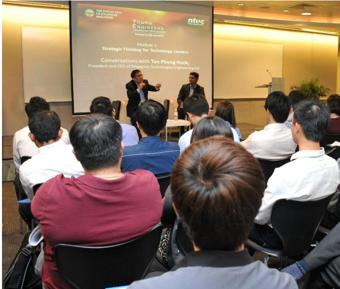
Dialogue with CEOs