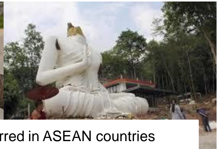
Big typhoon and earthquakes occurred in ASEAN countries