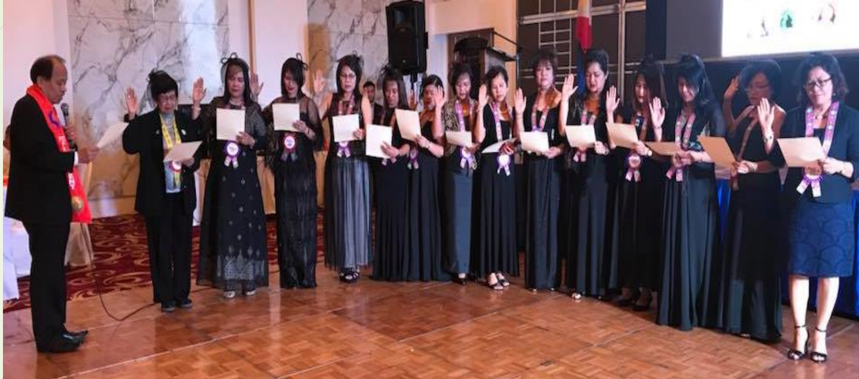
PTC-WEN Oath Taking on March 8, 2018 at Century Park Hotel