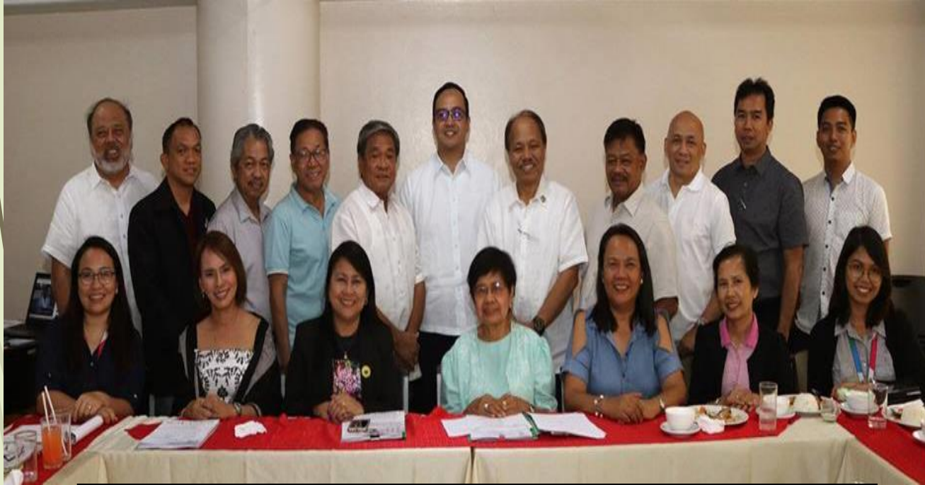
PTC with MWF @ UP Hostel on May 11, 2018