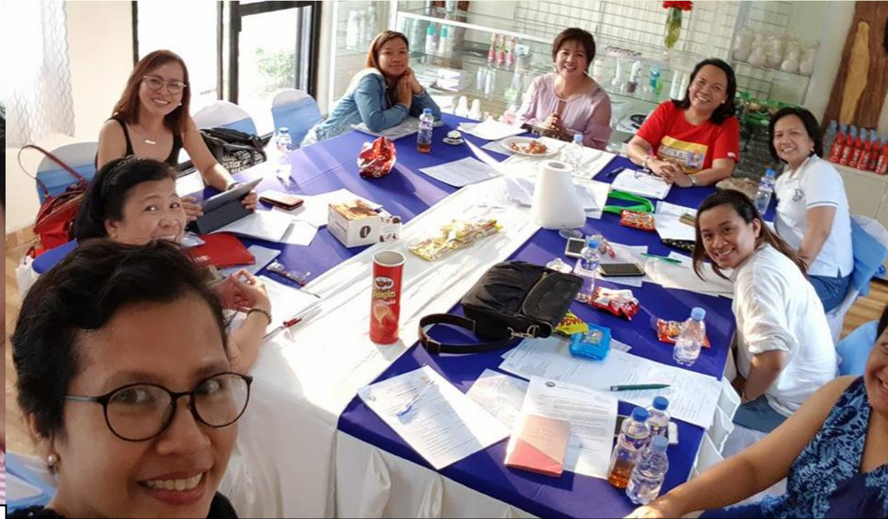
February 16, 2018 @ Al Amir Resort, Tarlac City hosted by PICE-Global