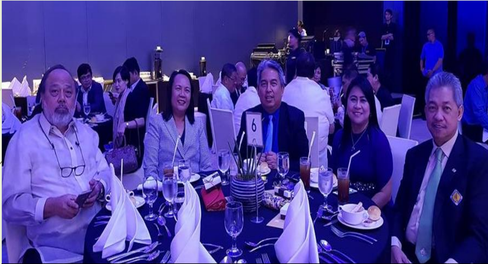
Awarding Ceremony of Manila Water Foundation for Engineering Excellence