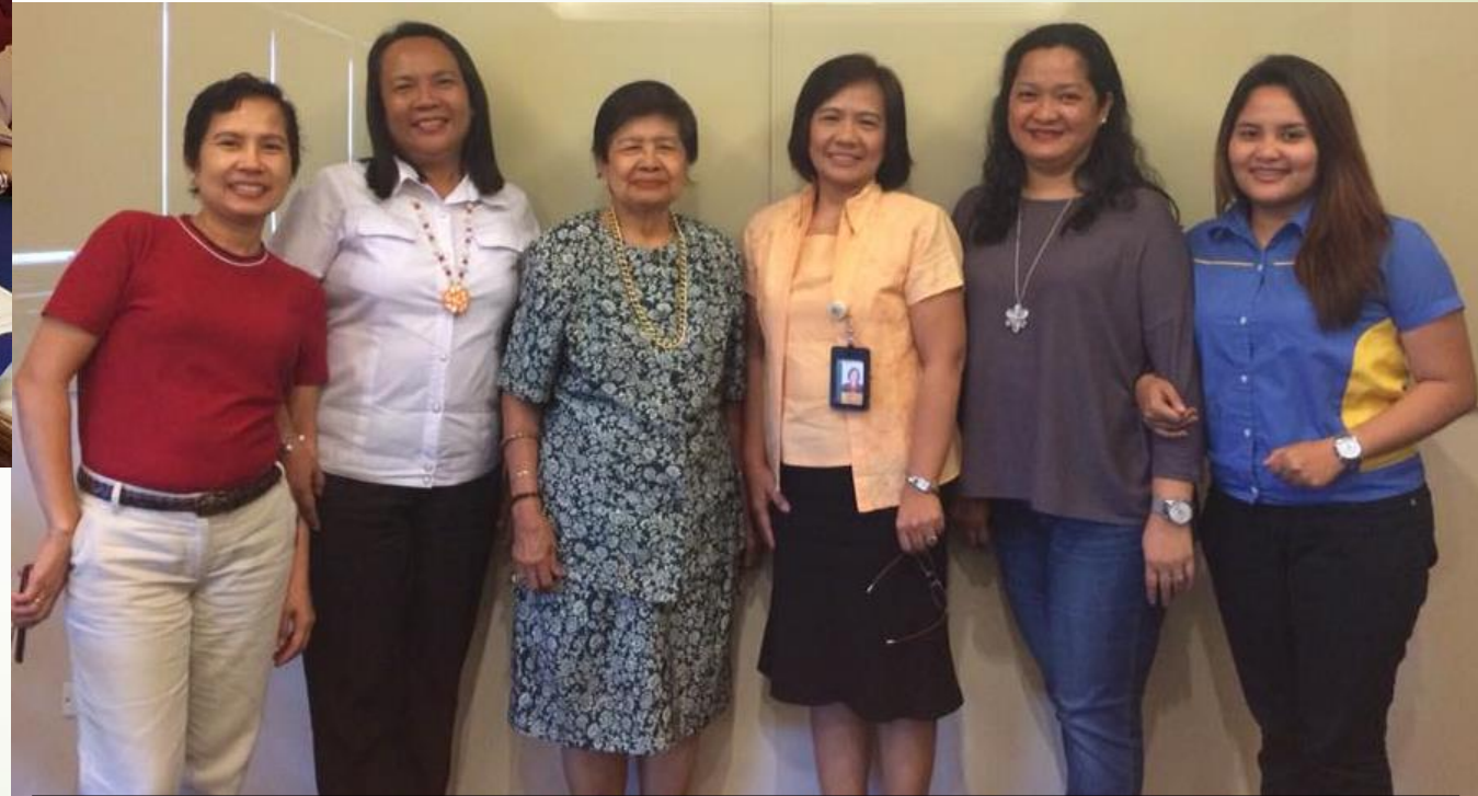
April 11, 2018 @ FEU Tech hosted by IECEP