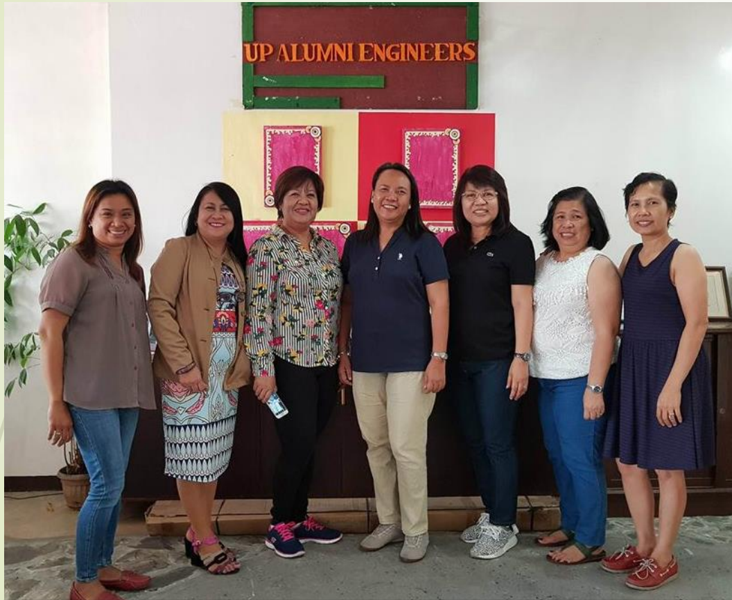
May 12, 2018 @ NEC hosted by PICHE