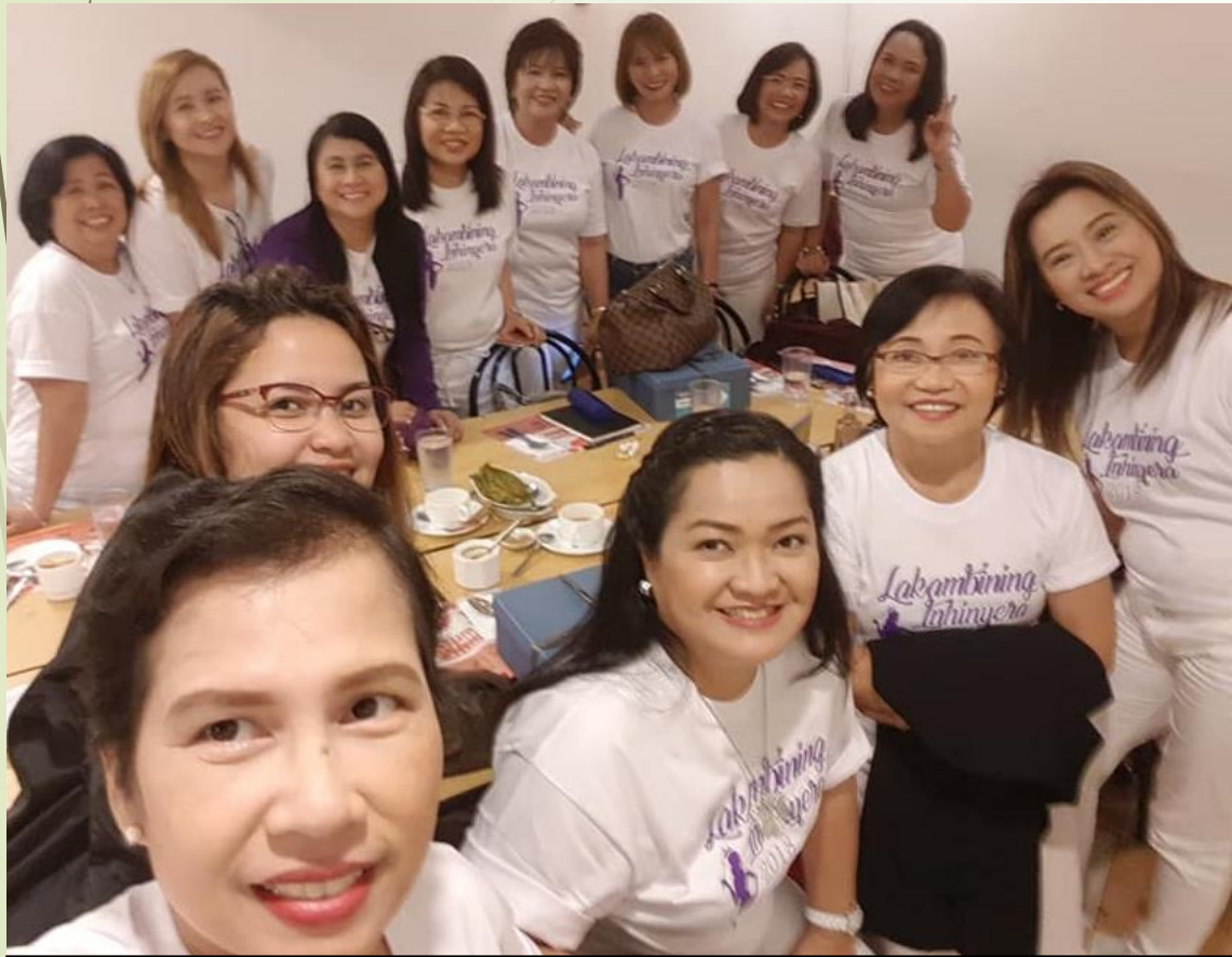
July 11, 2018 at Chicken Bacolod Inasal hosted by PICE