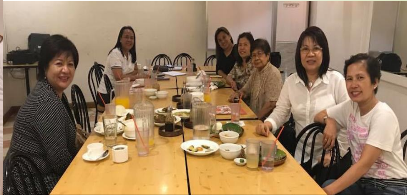
August 1, 2018 at Chicken Bacolod Inasal hosted by GEP