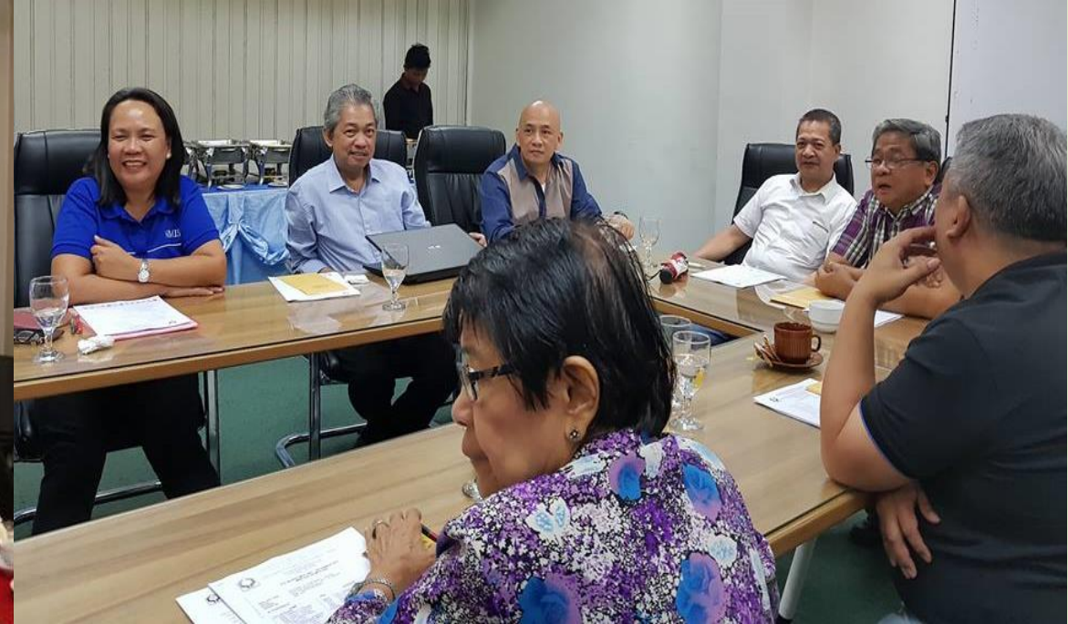
January 11, 2018 @ NEC, UPD