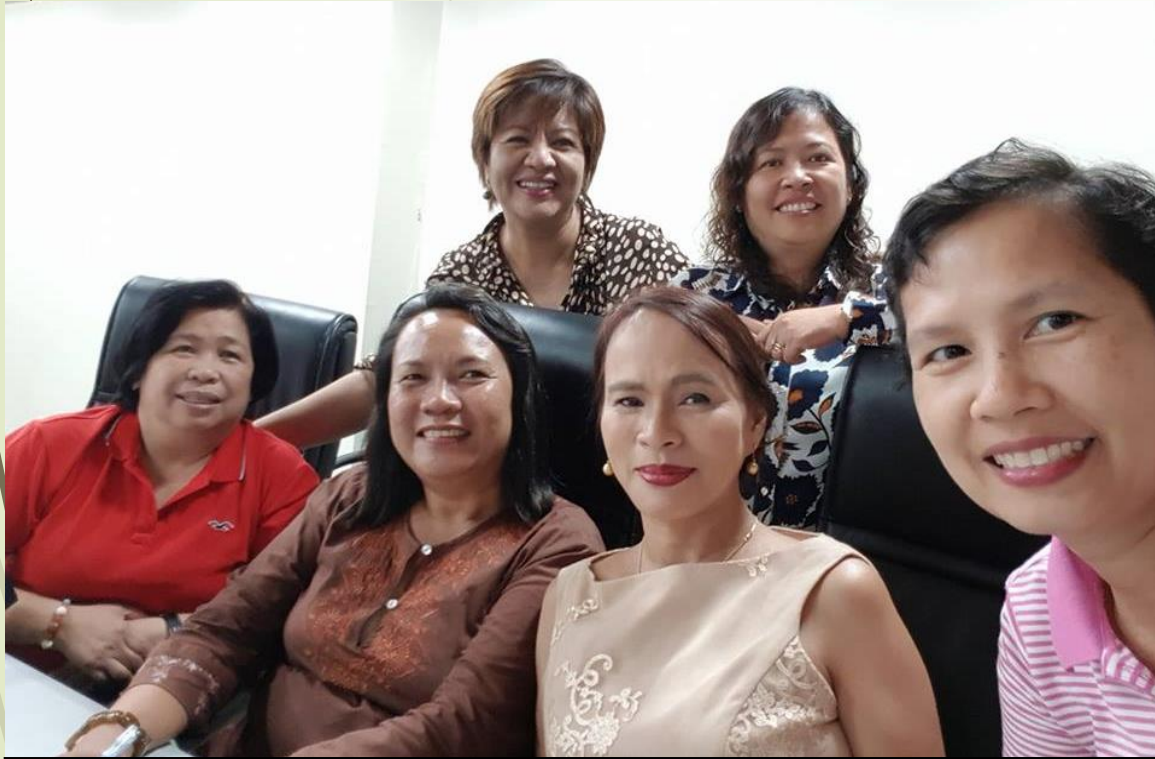
January 27, 2018 hosted by PSABE