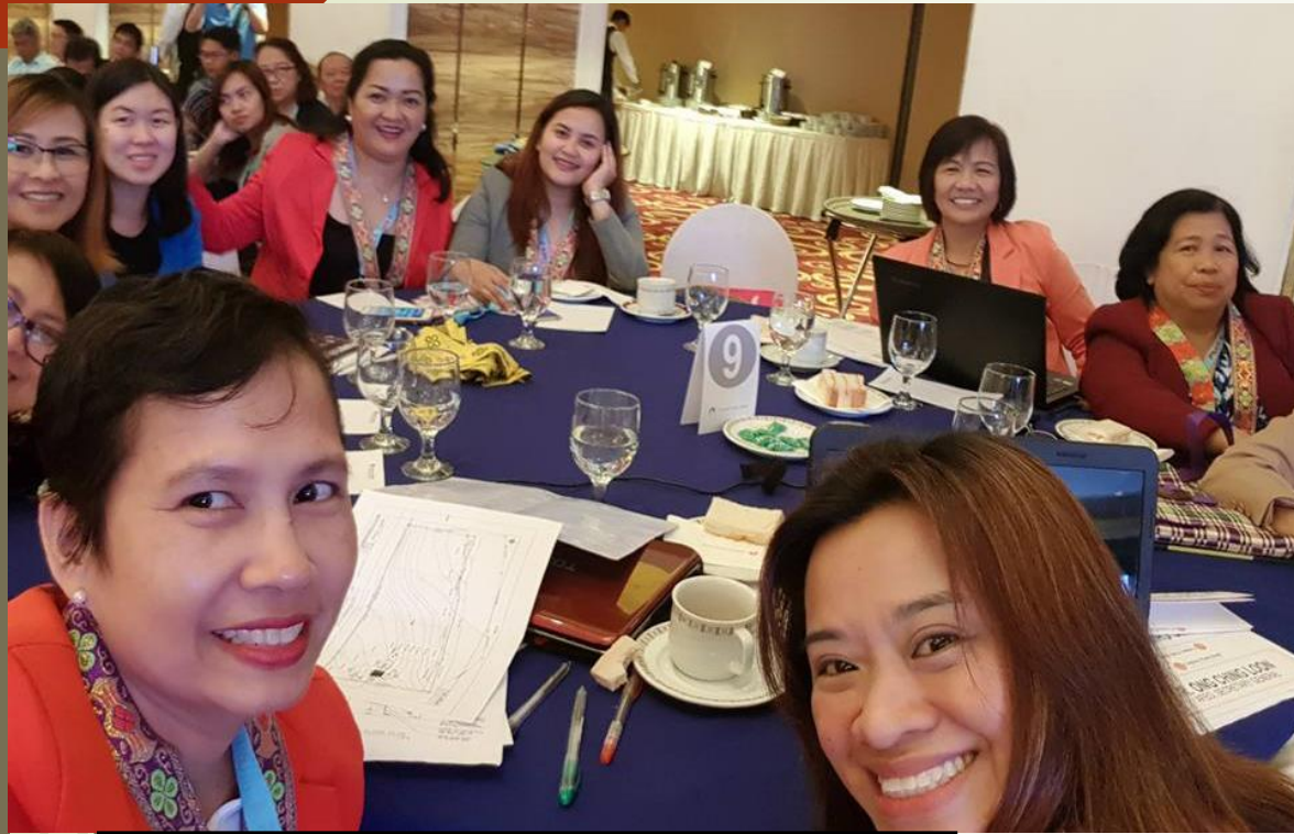
March 9, 2018 @ Century Park Hotel