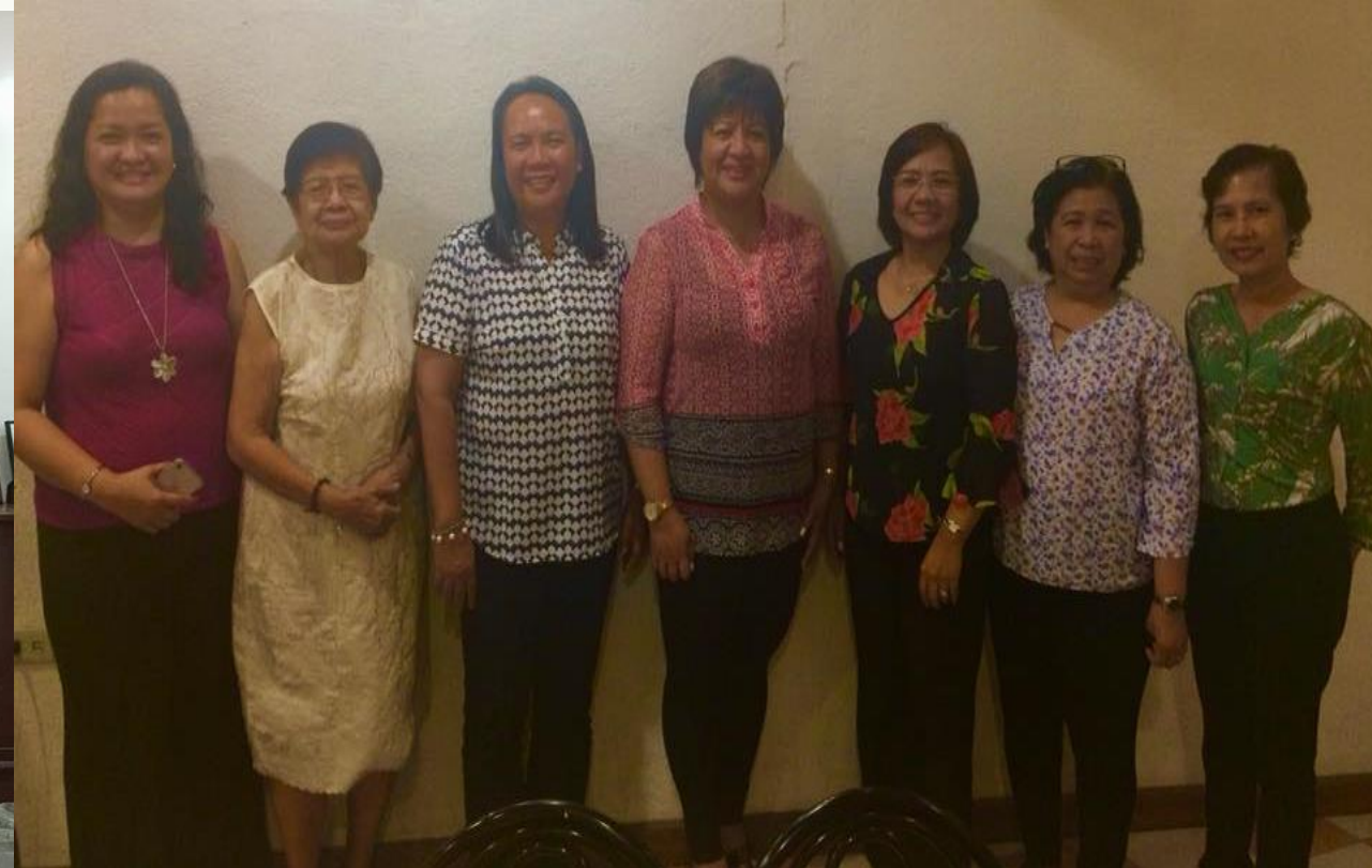
June 9, 2018 Meeting @ Chicken Bacolod Inasal hosted by PSSE