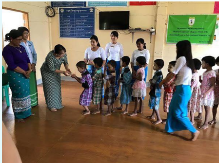
5-7 August, Indonesia