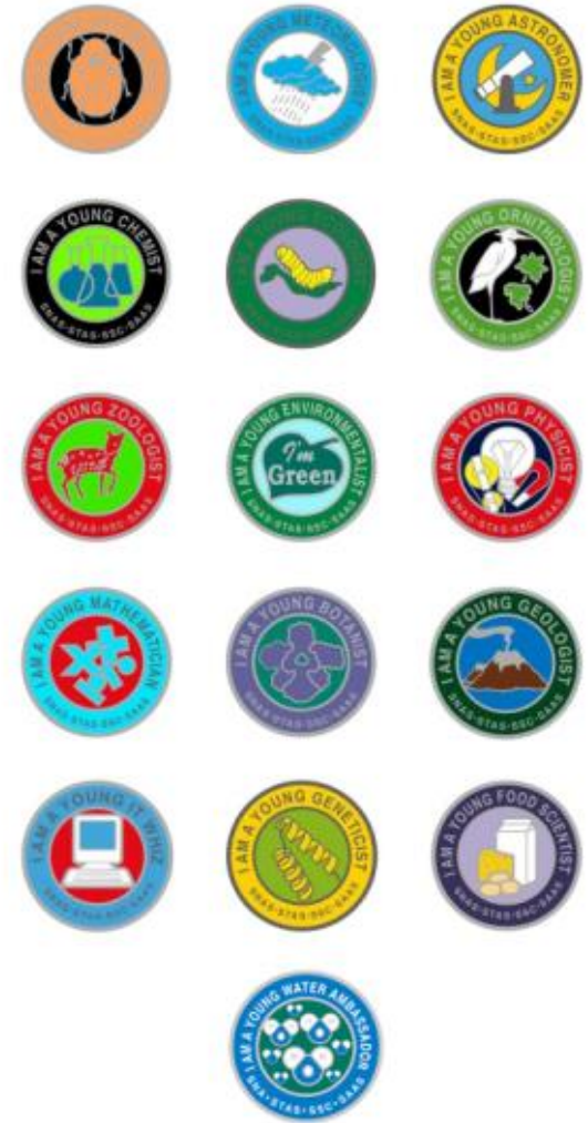
Badge Pins for the different cards