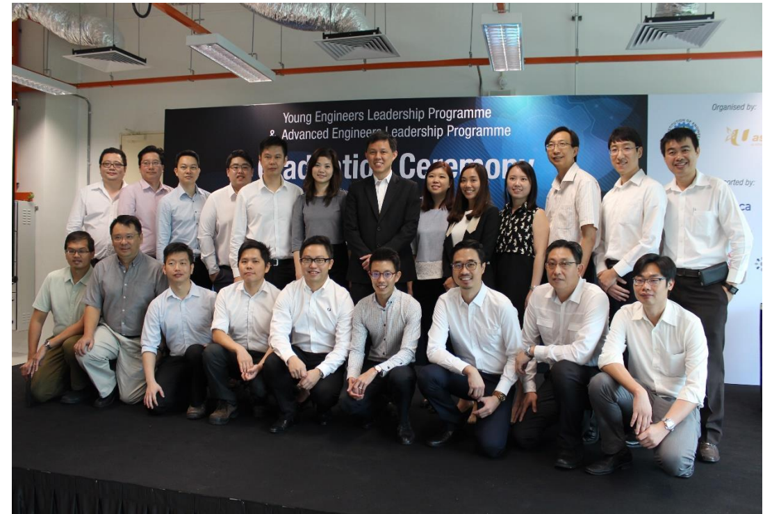
AELP Graduation Ceremony on 16 January 2017 with Mr. Chan Chun Sing